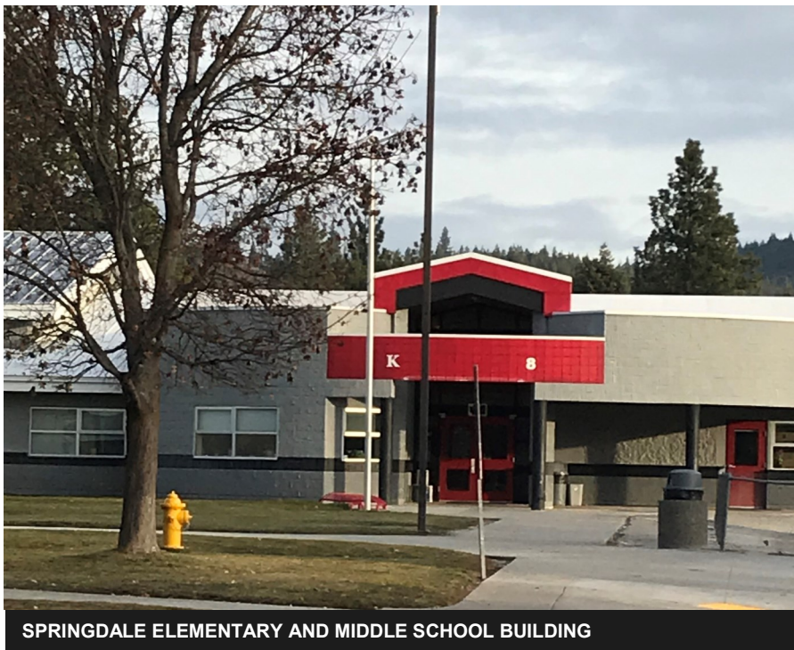
SPRINGDALE ELEMENTARY AND MIDDLE SCHOOL BUILDING